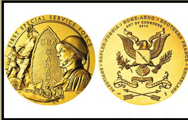
First Special Service Force Congressional Gold Medal

Tuesday, March 22, 2016 5 pm Danish Canadian Club 727 11 th Ave SW Tickets $45