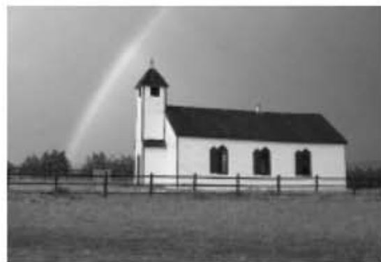
McDougall Stoney Mission Church, Morley