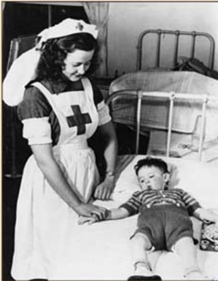
Junior Red Cross Hospital in Calgary, ca. 1935