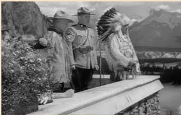
Still from The 49 th Parallel , 1941