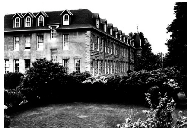
Sacred Heart Convent, Calgary, ca. 1945-48 Sisters, Faithful Companions of Jesus