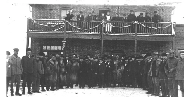
Boer War Volunteers, Pincher Creek December 1899